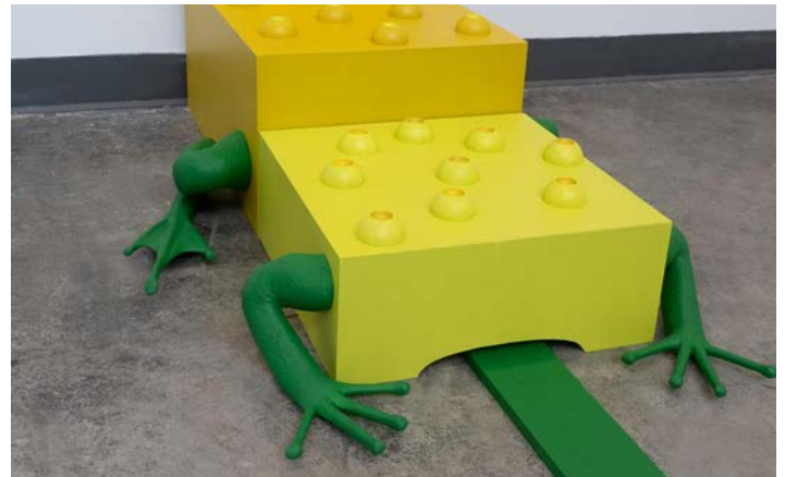
Insight Outsight (detail I), 2023.