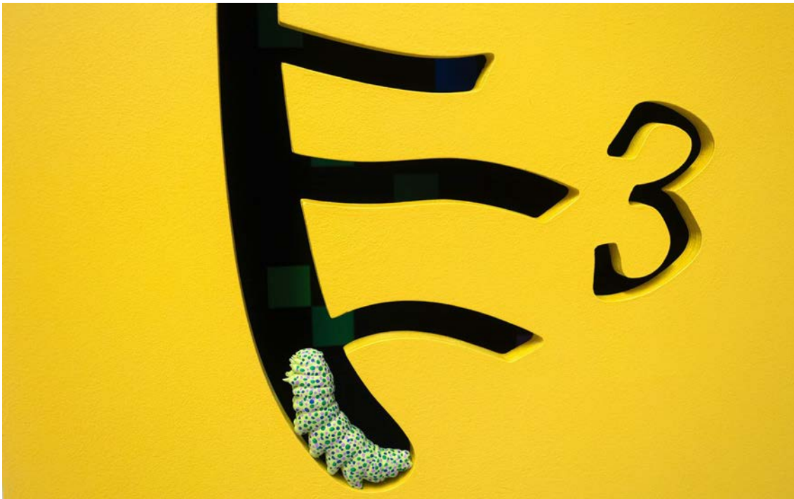
Detail of Insight Outsight by Ling-lin Ku, 2023.

A solo exhibition by Ling-lin Ku November 9 – December 22, 2023