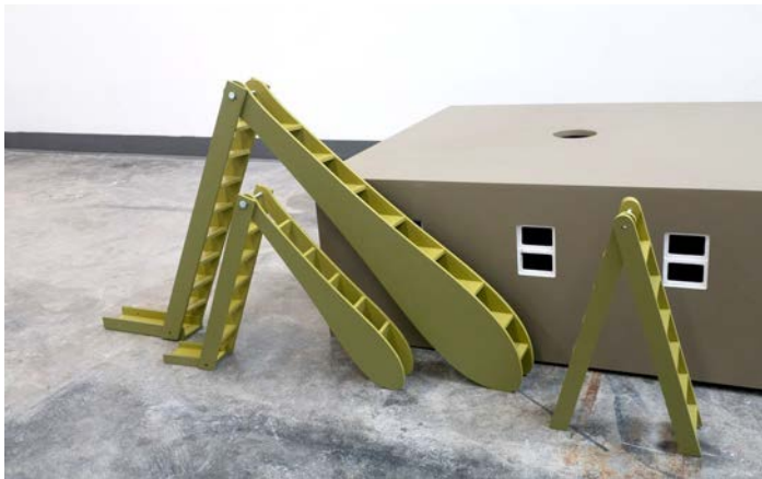
Insight Outsight (detail VI), 2023.