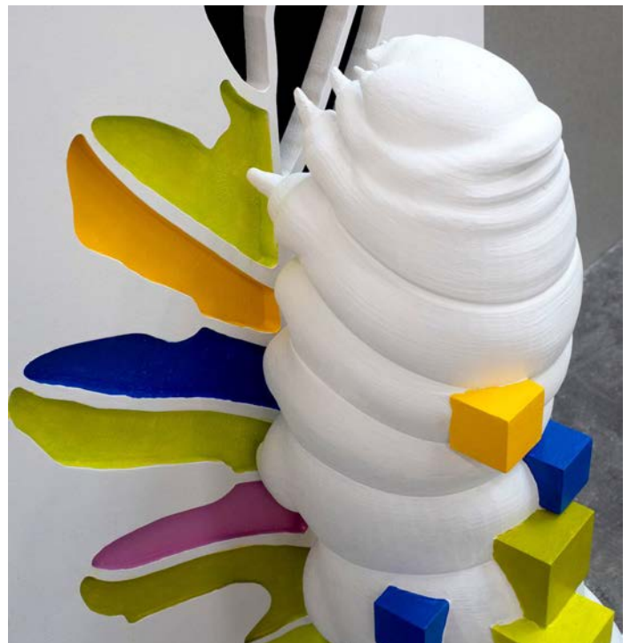
Insight Outsight (detail IV), 2023.